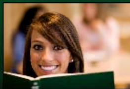
Information Literacy and Research