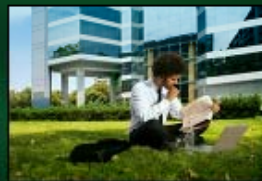
Books and Periodicals